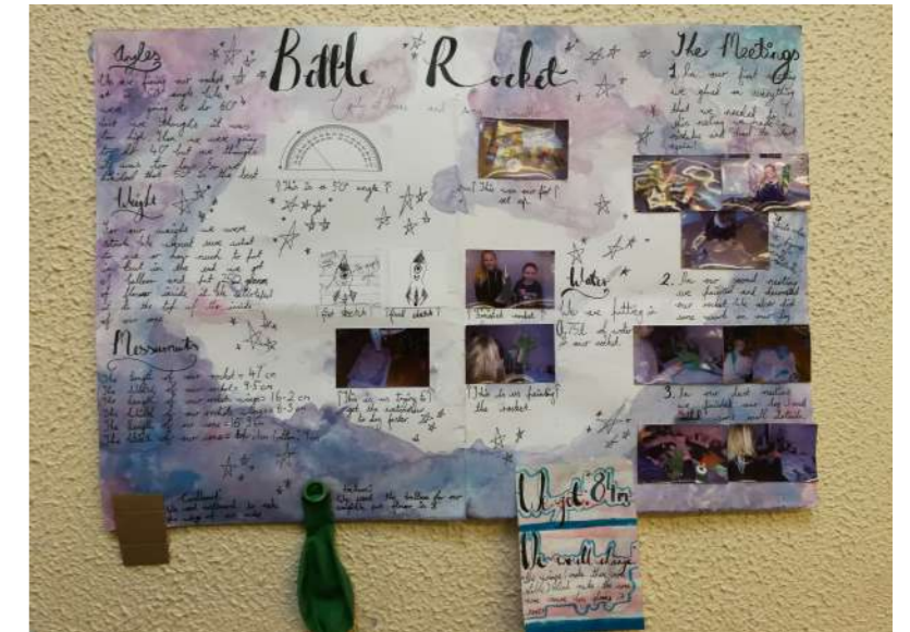
The winning log from the Bottle Rocket Challenge.