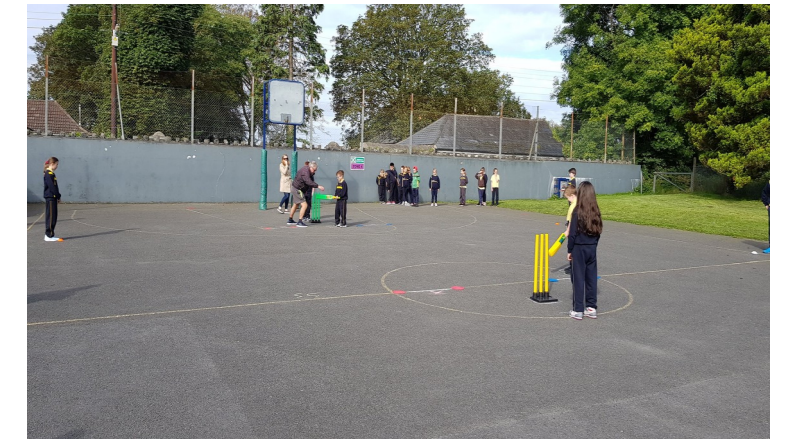
Our 3rd classes learning cricket.

Your generosity is very much appreciated by all at Scoil Íde.