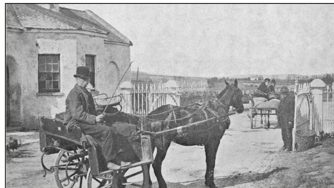
TOLL HOUSE AND GATE. Limerick side of Athlunkard Bridge, Corbally. There was a toll of a half penny to anyone coming into Limerick from Clare by foot, one penny if travelling by horse and cart. The bridge was declared toll free on 28th April 1884.