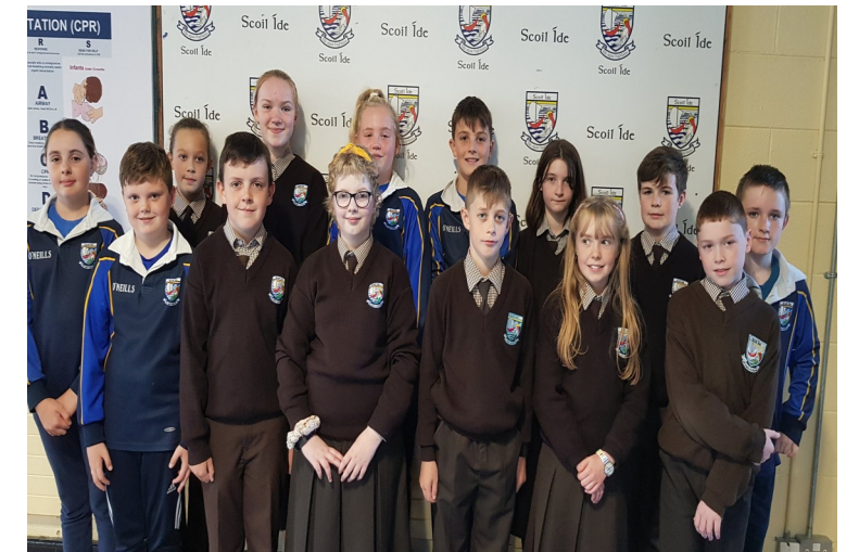
Students' Council 2019-2020

The Pay it Forward initiative plays a major role for the members of the council who will be working all year to spread kindness throughout the school and local community.