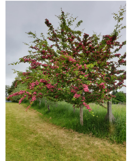
Pink Hawthorn Tree on school grounds