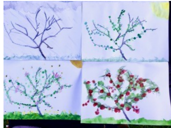
Art Project– The Lifecycle of the Apple Tree