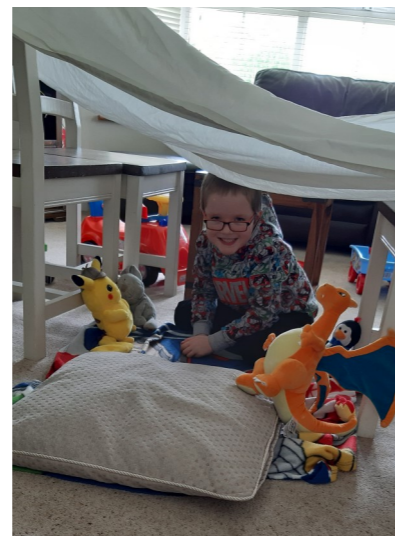
STEM Challenge: Build a fort