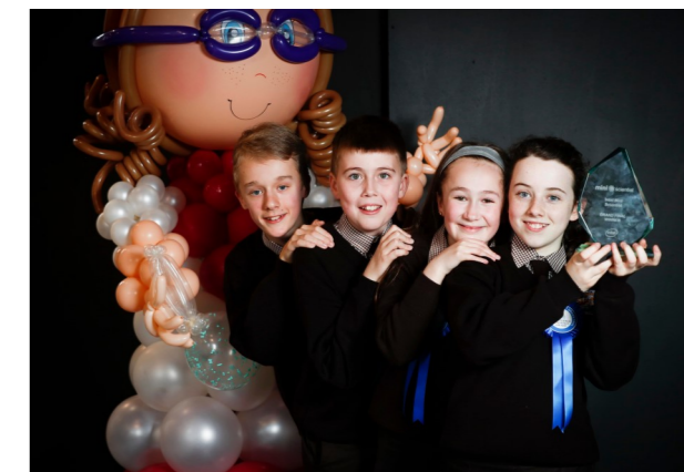
Our Mini Scientist Winners