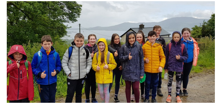
Students' Council Hike

Please consider this when purchasing uniforms/tracksuits for the coming school year as uniforms will be monitored in the coming school year.