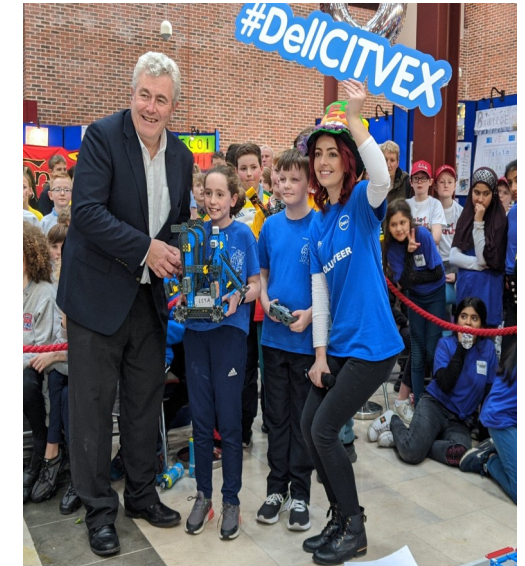
Pupils from Kavanagh at the VEX Finals in CIT, Cork.