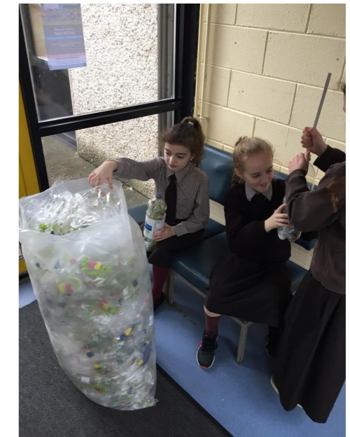
Pupils from Room 18 making Eco Bricks