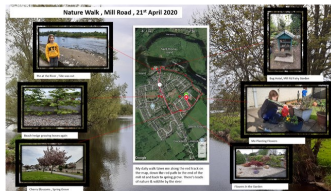
Nature Walk and Log Book