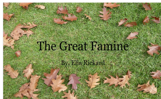
Great Famine Google Slides Project