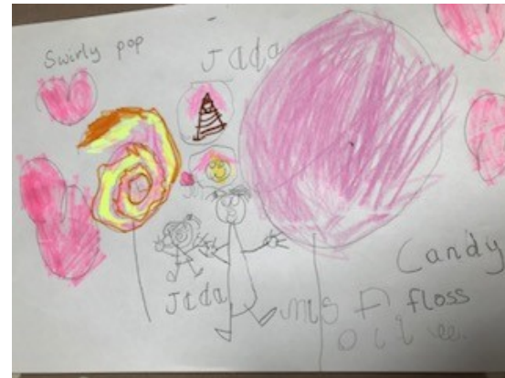
Drawing and writing